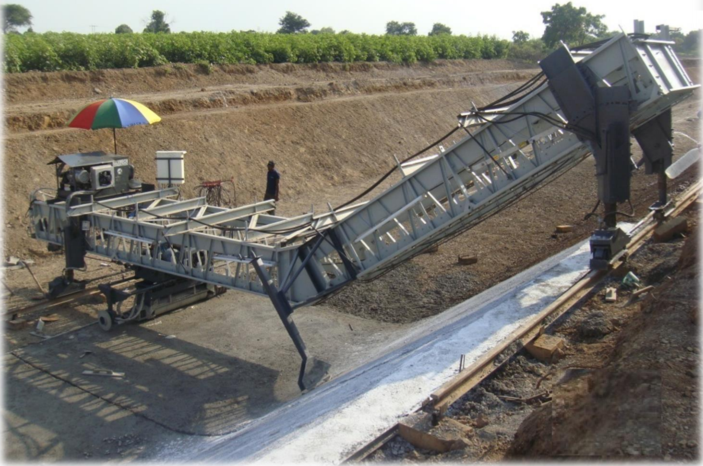
CONCRETE ELECTRICAL CYLINDER FINISHER CANAL-ROAD PAVER MACHINE

Rugged Design for Tough & Hot Site Condition. Simple in maintenance & operation. Quick change from angled to flat paving mode.